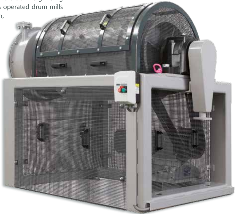
continuous TNS 200 K

The drum mills are used for fine and ultra-fine grinding of brittle materials. Discontinuous operated drum mills make, in addition to size reduction, homogenization of the material to be ground possible..