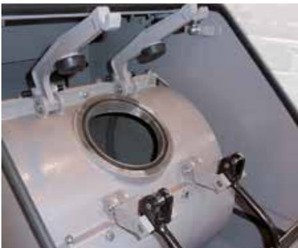
TTS 50 in the filling position with open closure

The drum mills are positioned for filling or emptying in inching operation or via an optional control with automatic positioning.