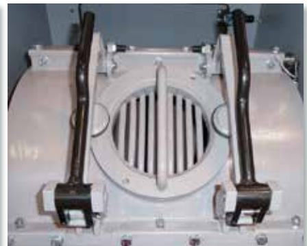
TTS 50 with emptying grid