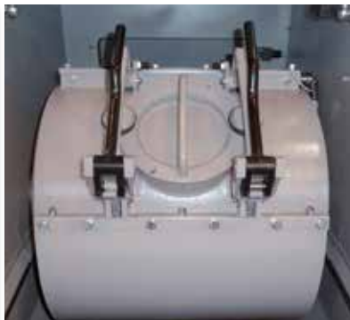
TTS 50 with sealing cover